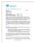
School District FCC Form 486 Notification Letter PDF 15 KB